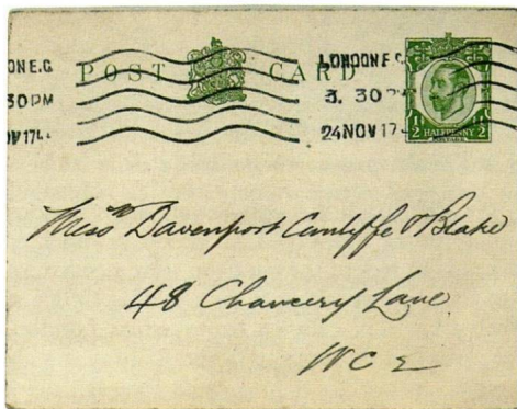
George V's three-quarter portrait on the 1911 postcard and the revised design showing him in profile on the 1918 issue

The ½d and 1d stamps used for postcards, lettercards and newspaper wrappers continued to be impressed by the letterpress process. In addition to the changes made to some of the embossed stamps used for postal stationery, it was felt desirable to change the design of these letterpress stamps. The Edwardian issues of these stamps had been based on Victorian